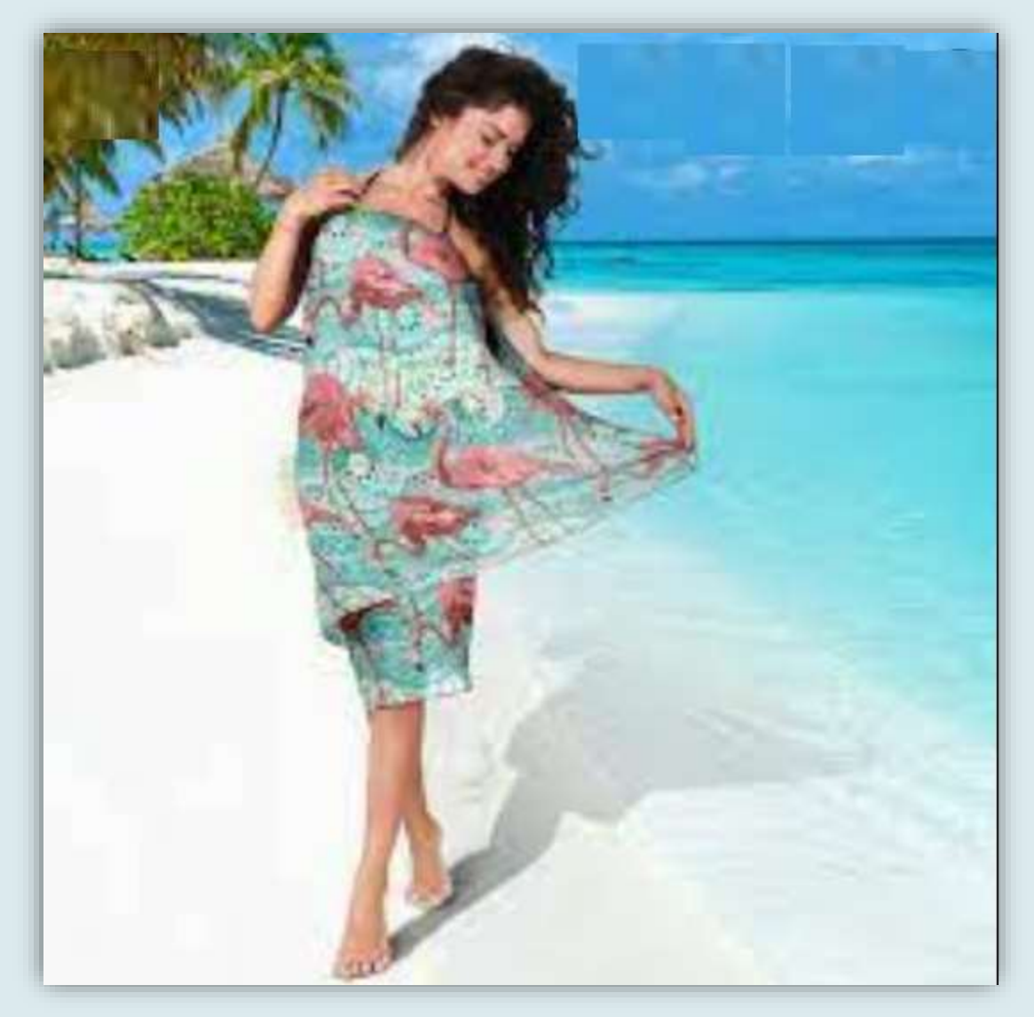
Available in all sizes