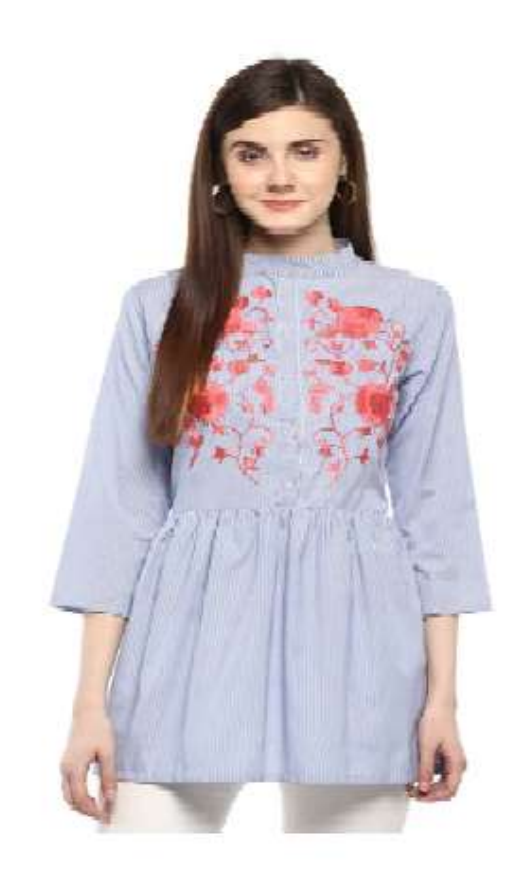
NISHTAG GREY Overcast LONG TOP FOR GIRLS

This LONG TOP from NishTag comes with detailing on the inside.